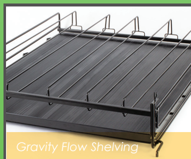
Gravity Flow Shelving